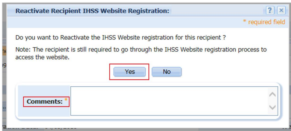
Figure 4 - Reactivate Recipient IHSS Website Registration Pop-up screen