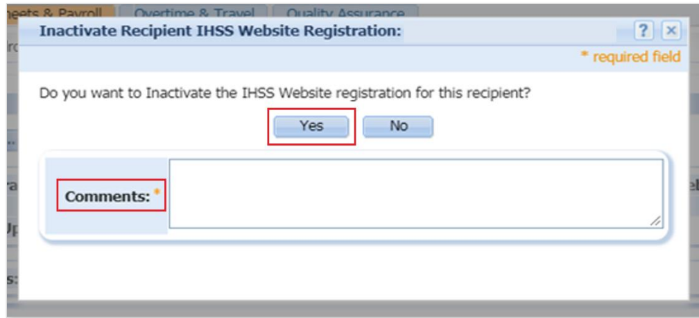
Figure 2 – Inactivate Recipient IHSS Website Registration Pop-up screen

When the recipient's ESP account is inactivated, the associated provider will be unenrolled from electronic timesheets only, but will still have access to their ESP account. An email will be generated to the provider(s), informing them that their recipient is no longer participating in electronic timesheets. All timesheets with a print method of "Electronic" that are in "Issued" status or "Pending Electronic Recipient Review" will be re-generated as replacement paper timesheets.